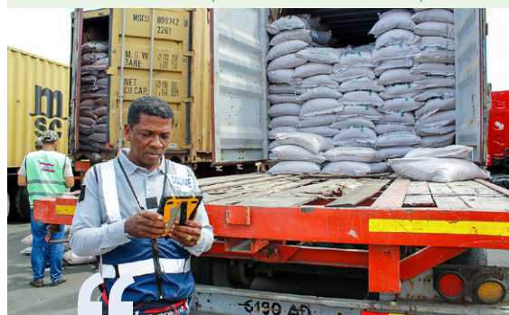
This photo was taken before the COVID19 pandemic.

Customs switched to more efficient and user-friendly systems, such as ASYCUDAWorld, that combines modernization of Customs processes and trade facilitation, with the technical assistance of UNCTAD and the financial support of Japan.